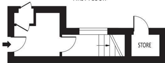
GROUND FLOOR ENTRANCE